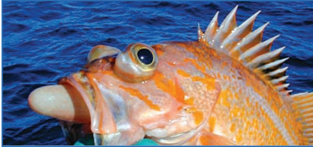
Even fish with bulging eyes and protruding stomach can survive if returned to depth quickly. Note: the organ protruding from the fish's mouth is the stomach, not the swim bladder.

Amazingly, rockfish that look dead at the surface can “pop” back to life if quickly returned to a native depth range. Because of this, rockfish that you must, or want to, toss back should be quickly recompressed.