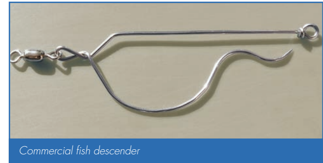
Commercial fish descender

Inverted barbless hook with weight: Hook fish through lower lip from inside to outside, to keep hook from puncturing an extruded stomach and to prevent line cuts to eyes. You can also hook a fish through the membrane on its upper lip from outside to inside, which some say makes for easier release. In both cases, the weight must lead the fish into the water and be heavy enough to sink it to the desired depth. Fish is released with a sharp jerk on the line. Caveats: Hook can puncture an extruded stomach. Once a fish reaches a depth at which it regains muscle coordination, it may wrestle free prematurely. Method works best with smaller fish.