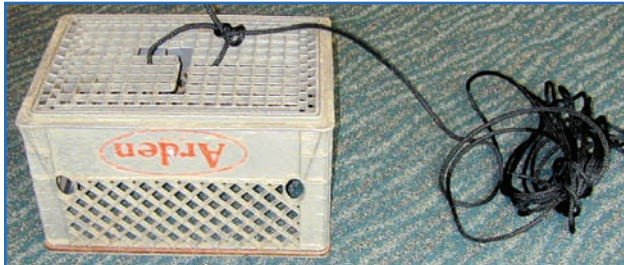
Upside-down crate, weighted and attached to rope

There are many ways of returning a fish to a depth at which it can recompress. Your choice may depend on the size of the fish you usually catch, your experience as an angler, sea conditions and cost.