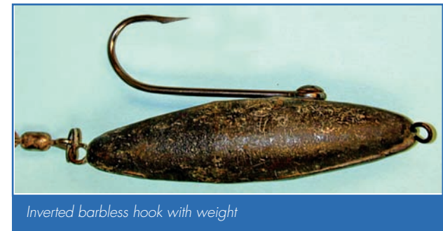
Inverted barbless hook with weight

Crate is dropped over the fish and then, with the buoyant fish inside, lowered to a minimum depth of 60 feet and kept down until it can swim out on its own. Caveats: In rough seas, fish can escape prematurely and the crate may bang against a fish's extended eyes. Try lowering the fish down gently or paint crate's inside with a rubberized coating to smooth sharp edges.