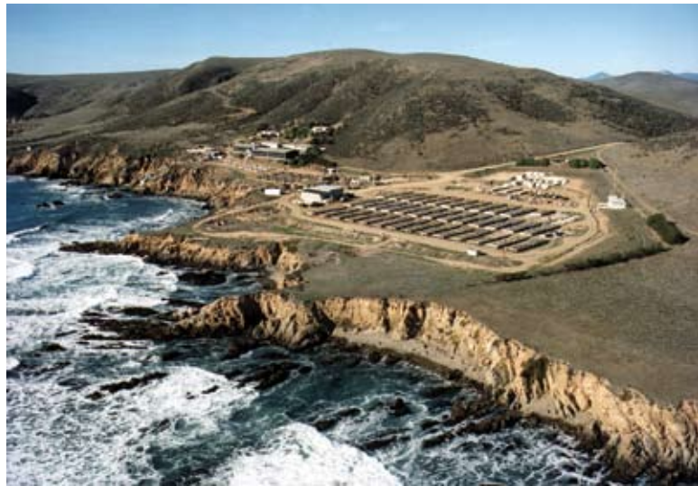
The Abalone Farm, Cayucos, California.