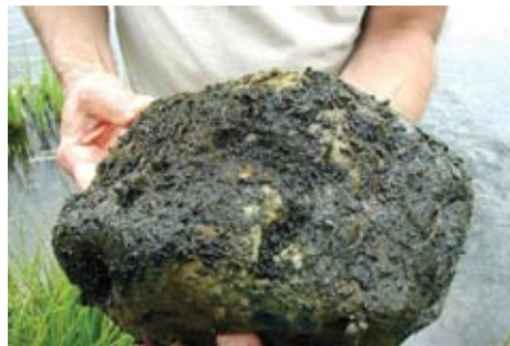
Rock covered with the invasive New Zealand mudsnail.