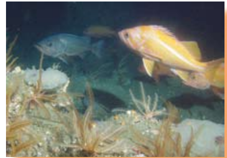
Canary, bocaccio and yelloweye rockfish.