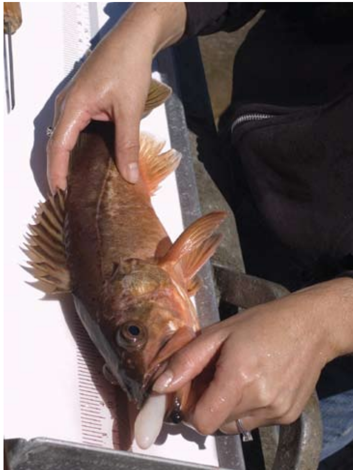
This bocaccio has been hauled up from depth quickly and is suffering from “barotrauma,” a fish's version of the “bends.” Rapid pressure change has forced its stomach through its mouth. Amazingly, this grotesque-looking creature can survive if handled properly.

As with human divers, fish that experience rapid pressure change can suffer a host of physiological problems, including air embolisms and strokes. Many also have an internal ballasting mechanism, an air bladder that during a rapid ascent can swell with enough force to push a fish's stomach out through its mouth or distend its eyes. Anglers call these grotesque fish “popped.” Boats fishing