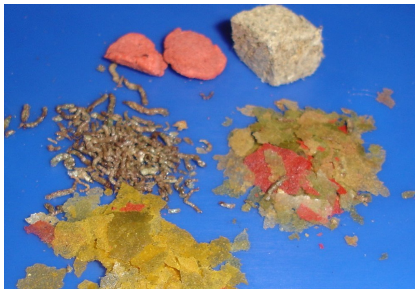
Various types of prepared fish food. Some may look familiar to aquarists.

to propagate yellowtail in net pens in Baja California, Mexico. These projects are establishing the husbandry techniques needed for developing a North American aquaculture industry that can compete with overseas operations.